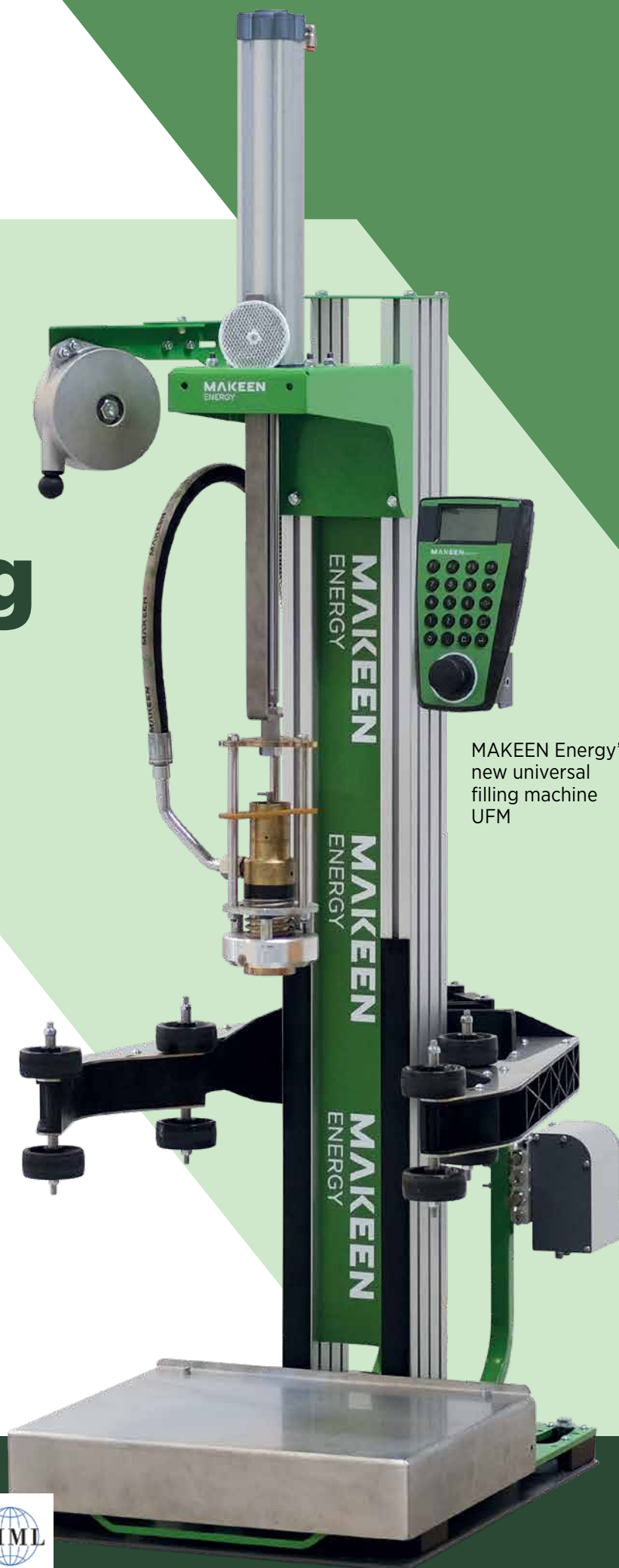
MAKEEN Energy's new universal filling machine UFM

All the experience and know-how, merged into one. The new MAKEEN Energy product line for filling and maintenance of LPG cylinders combines the best of both Kosan Crisplant and Siraga technology with a range of added benefits. It is the next generation choice for LPG fillers everywhere.