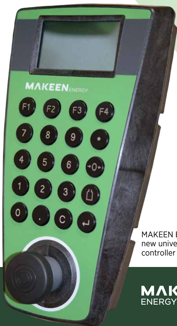
MAKEEN Energy's new universal controller MUC

Of course! You will still be able to receive the same service, support, and spare parts as before.